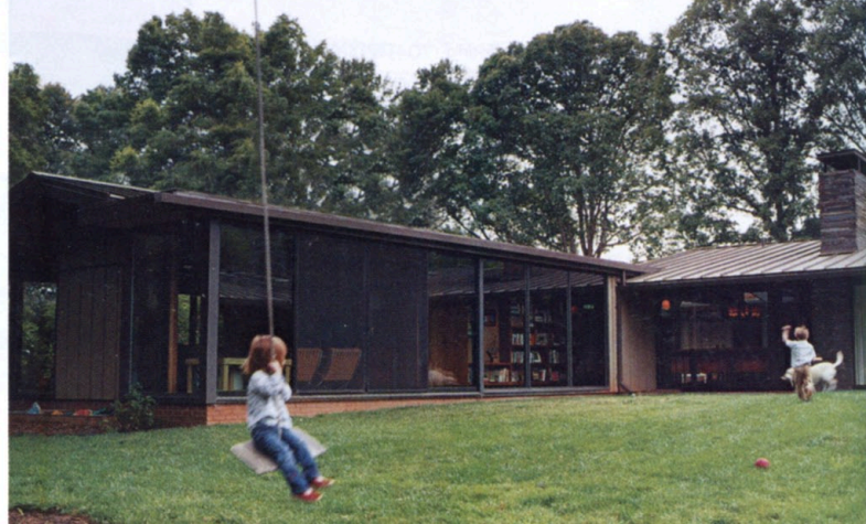
During parties, guests can wander through the glass doors from the playroom (in the addition, left) across the backyard to the living room (in the 1956 building).

CREDENZA Custom $6,500 Elite Woodworking (704) 893-0842 PAINT (on credenza) Sangria #2006-20, benjaminmoore.com for stores PULLS (on credenza) #8370 $49.28 each, muffshardware.com for information WALL COVERING "Reed Grass" in Pumpkin $41.99/roll, waverly.com for stores TV 46 "Bravia" $3,600 sonystyle.com SOFA FABRIC "ikat Blue" $25/yard, ballarddesigns.com COFFEE TABLE (similar to shown) T.H. Robbsjohn Gibbings for Widdicomb $2,200 Historical Materialism (518) 671-6151 CHAIRS Ludwig Mies van der Rohe "Barcelona" from $3,888 each,