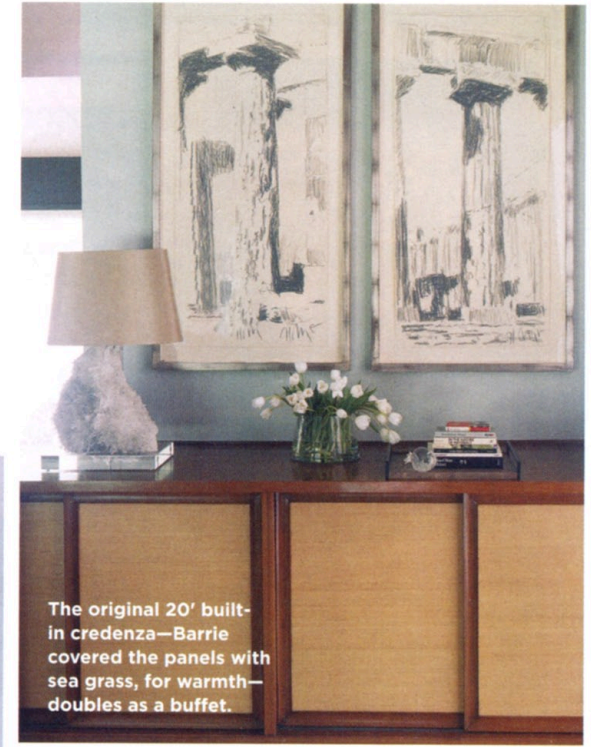
The original 20' built-in credenza—Barrie covered the panels with sea grass, for warmth—doubles as a buffet.

WHAT SHE DID Initially, Barrie painted all the rooms soft white, but after discovering that colors improved things exponentially, she went with a pale blue in the dining room, which segues seamlessly into the pale green of the living area beyond. The Glu-Lam beam above the front door (support beams run through every room of the house) is painted a neutral green-brown "that's not really a color at all" but has left. Completely unmodern accessories—a '20s Empire chandelier, '30s bronze sconces and an artfully tarnished mirrored console (Barrie's own design) topped with brand-new Chinese vases—inject grandeur.