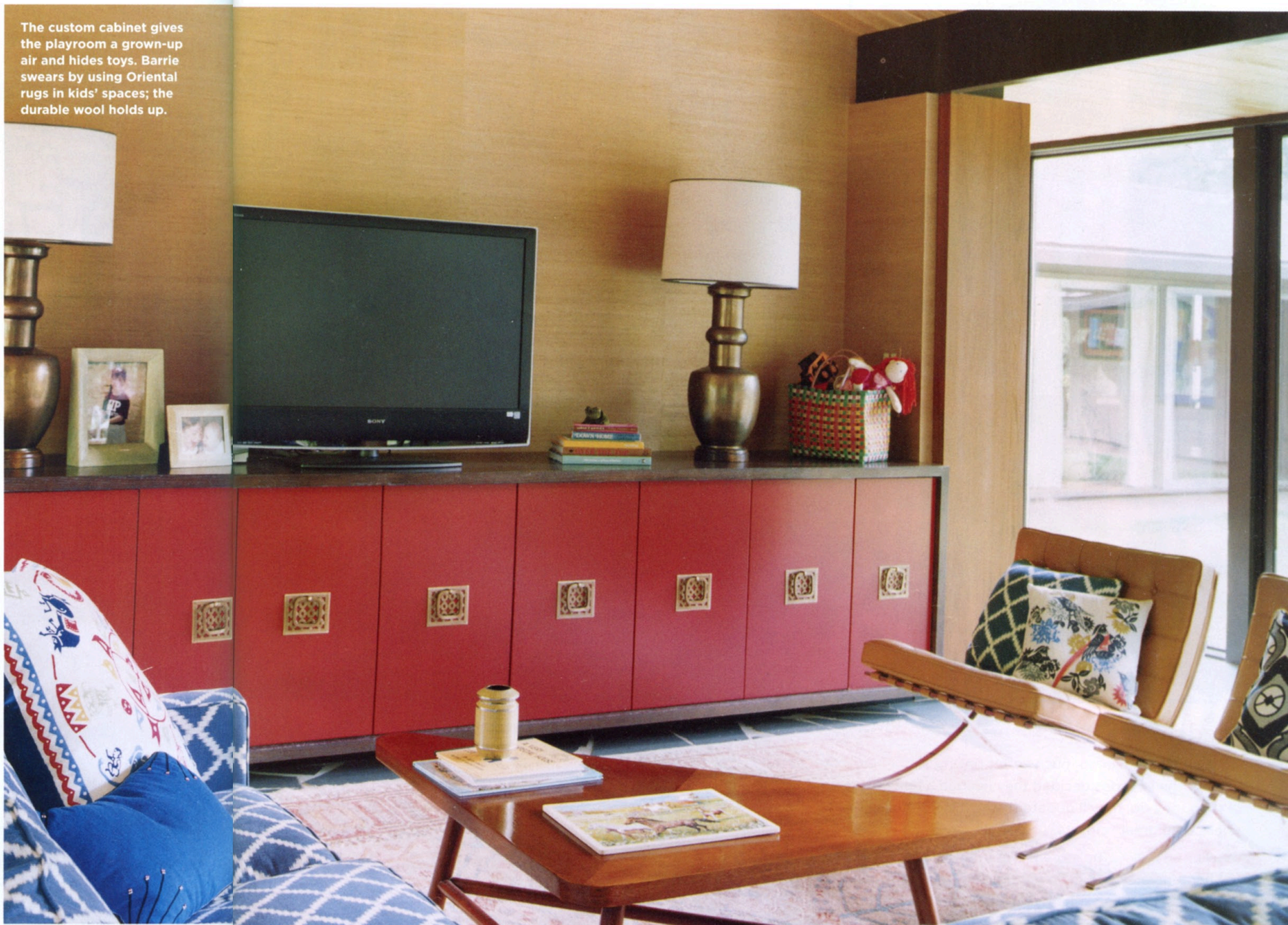
The custom cabinet gives the playroom a grown-up air and hides toys. Barrie swears by using Oriental rugs in kids' spaces; the durable wool holds up.