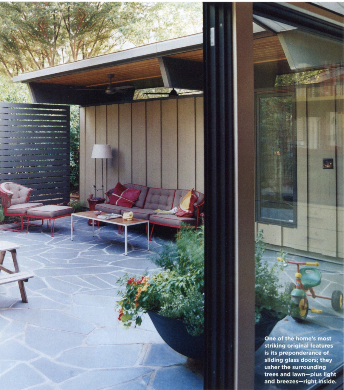
One of the home's most striking original features is its preponderance of sliding glass doors; they usher the surrounding trees and lawn—plus light and breezes—right inside.