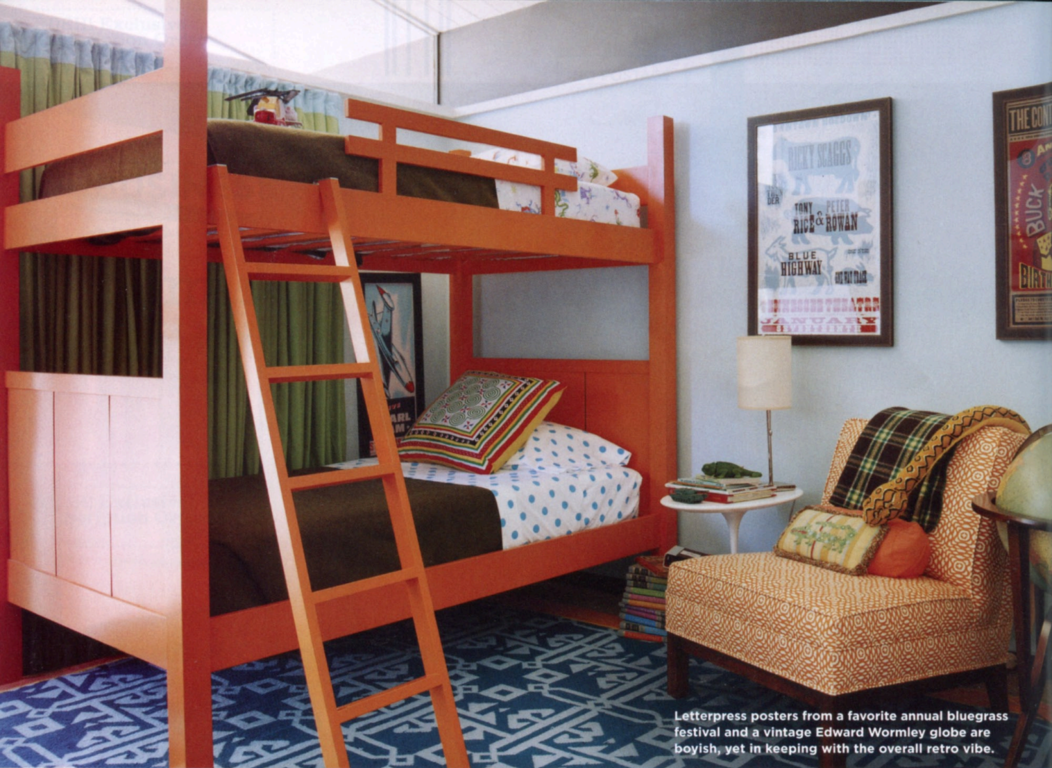
Letterpress posters from a favorite annual bluegrass festival and a vintage Edward Wormley globe are boyish, yet in keeping with the overall retro vibe.